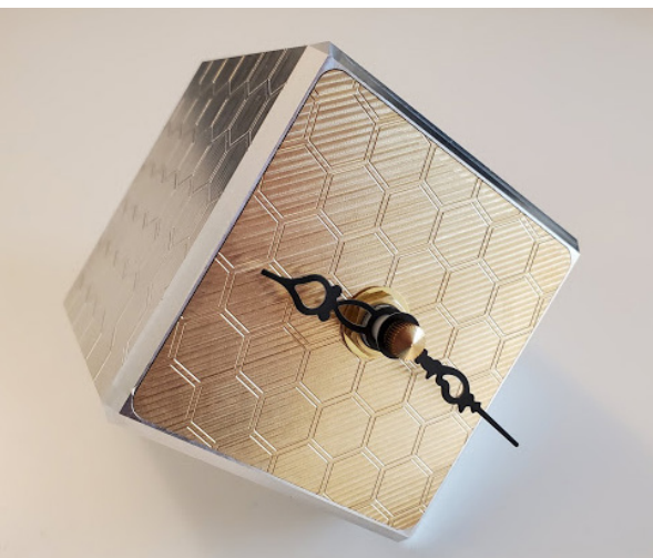
▲ Figure 2: Another example of a desktop clock made by Deviant Clockwork